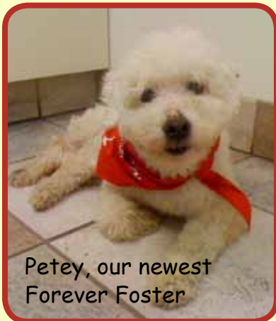
Petey, our newest Forever Foster

http://www.bichonfurkids.org/donations and specify Forever Foster under Purpose.