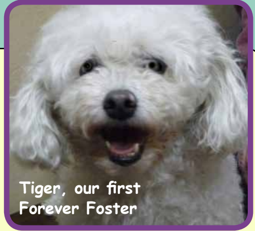
Tiger, our first Forever Foster

If you would like your name to appear on our website and be updated on a furkid's progress, let us know.