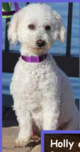
Holly and her Puppy Pile Day 3

Interested adopters can apply at www.bichonfurkids.org/Applications and can meet the puppies in February for adoption in early March.